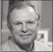
Senator Raymond Lesniak 20 th Legislative District